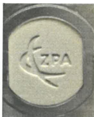
Seal (lead, aluminum or plastic)